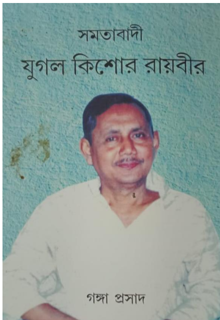
Fig.2. Secondary Literature in Bengali Language on Jugal Kishore Roybir