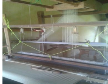
Weaving Cloth on Loom